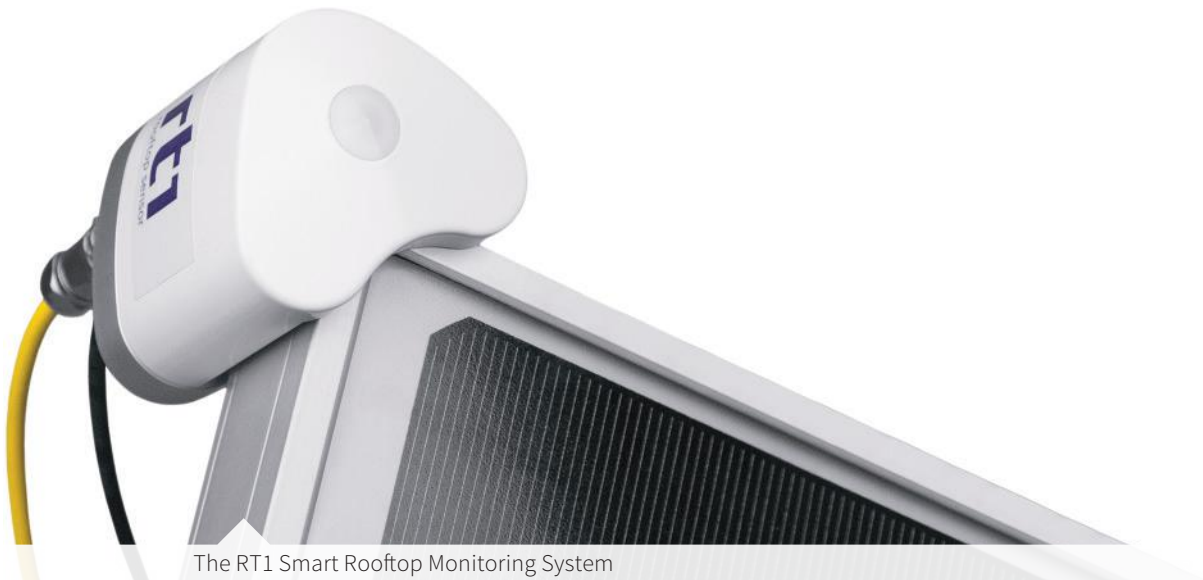
The RT1 Smart Rooftop Monitoring System

By Donald van Velsen, Kipp & Zonen Product Manager - Solar energy PV installations on building roofs are really taking off in many parts of the world. On apartment buildings, car parks, sports facilities and smaller industrial sites. No land purchase or leasing is needed and the power is available on-site, where needed, for example powering air conditioners when the solar energy and heat input are greatest. If excess power is available it can be stored in batteries or (if feed-in tariffs are favourable) sold back to the grid operator.