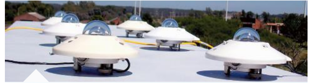
Calibration of pyranometers at LES

LES also maintains a solar radiation monitoring station for DNI, DHI and GHI comprising a SOLYS2 sun tracker with sun sensor and shading ball assembly, pyrheliometer and ventilated pyranometers. The unventilated CMP10 shown is fitted for comparison purposes. The details of the LES solar measurement network can be found at www.les.edu.uy ■