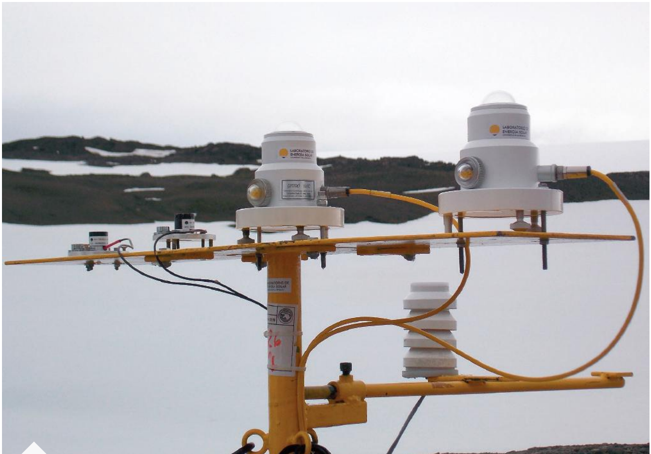
UVS radiometers at Collins Harbour in the Antarctic summer of 2016-2017

The Solar Energy Laboratory (LES) of Uruguay has recently conducted its first measurement campaign to assess UVA, UVB and UVE (Erythemal) radiation in the Antarctic Summer. The Base Científica Antártica Artigas (BCAA) of the Uruguayan Antarctic Institute is located at latitude 62°11'(S) and longitude 58°52'(W) at Collins Harbour on King George Island (the largest of the South Shetland Islands), about 100 km from the Antarctic peninsula.