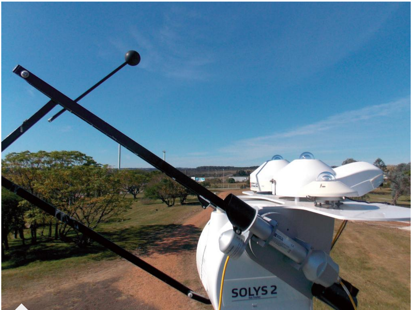
Continuous irradiance measurements with radiometers mounted on a SOLYS2 sun tracker at LES