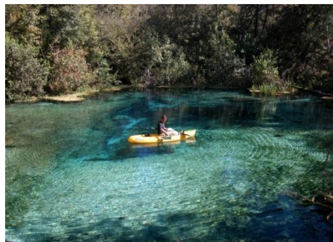
High water clarity at Ichetucknee Head Spring.