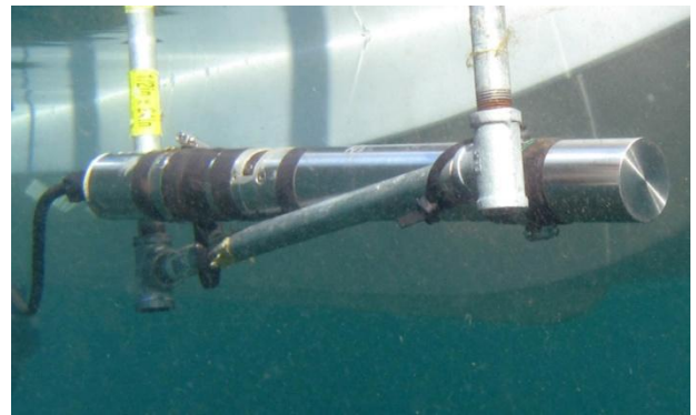
Above: SUNA deployed for longitudinal profiling.